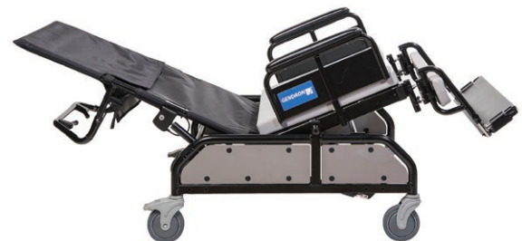
Back in full recline position and seat in reverse tilt position.