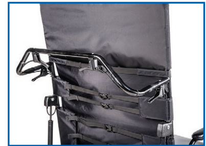
Two sets of levers control back recline and seat tilt, while adjustable straps allow upholstery to conform to the user.