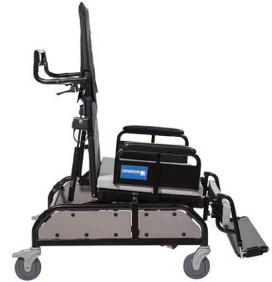
Back in up position and seat in forward tilt position.