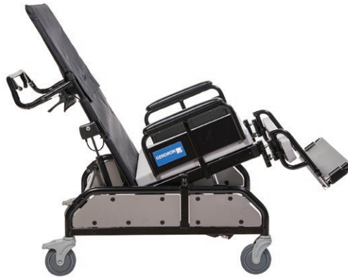
Back in up position and seat in reverse tilt position.