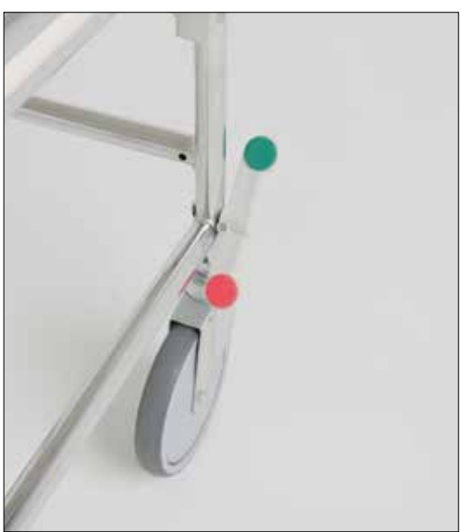
Brake Pedal Shown in BRAKE Position