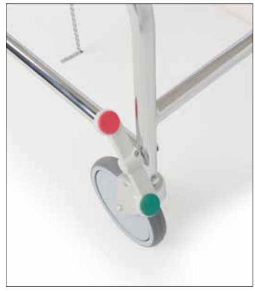
Brake Pedal Shown in STEER Position

The Brake pedals are located at two opposite corners of the stretcher above the casters. Refer to the following illustrations for operation.