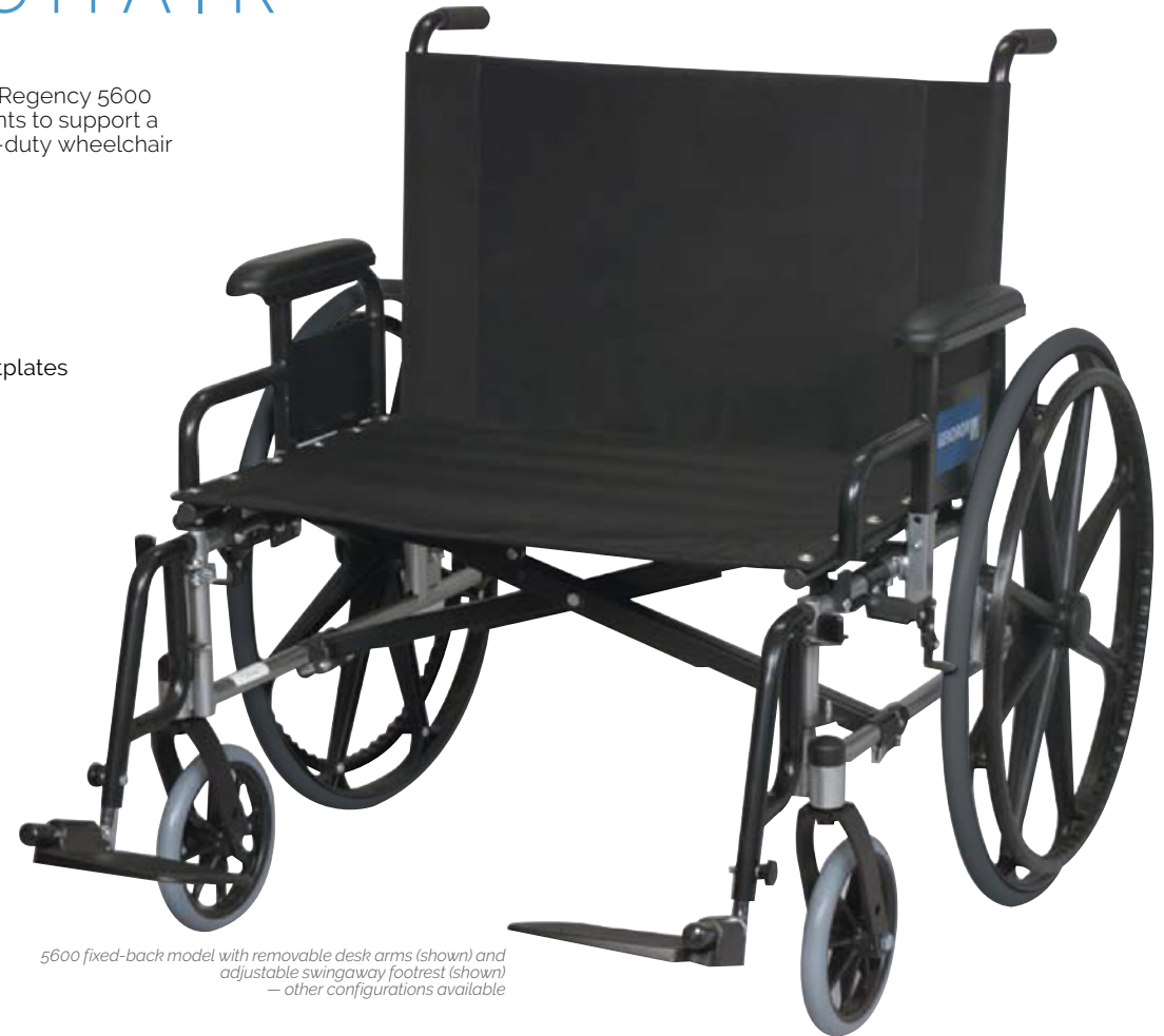
5600 fixed-back model with removable desk arms (shown) and adjustable swingaway footrest (shown) — other configurations available