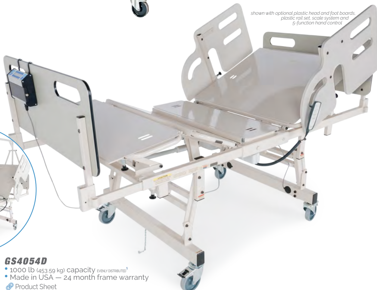
shown with optional plastic head and foot boards, plastic rail set, scale system and 5-function hand control