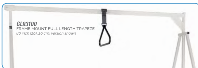
GL93100 FRAME MOUNT FULL LENGTH TRAPEZE 80 inch (203.20 cm) version shown