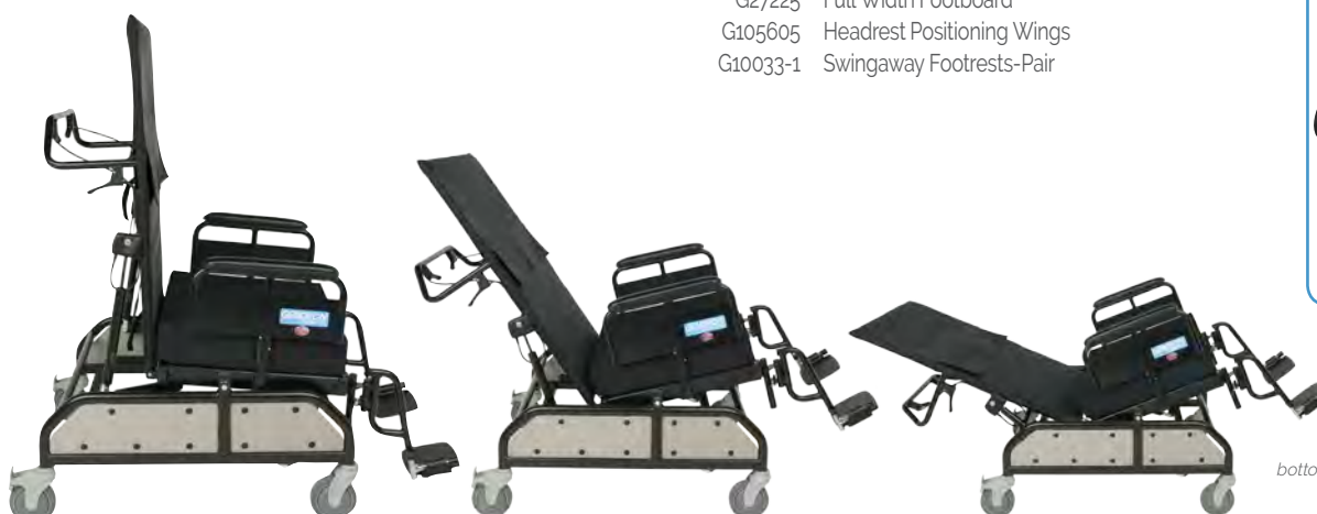
bottom chairs shown with swingaway footrests