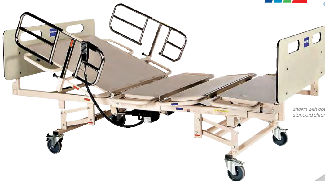
shown with optional plastic head and foot boards, standard chrome rail set, and standard 3-function hand control