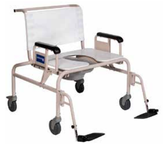
5226 / 5228 Bariatric Shower Commode Chair