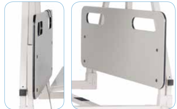
39" HDPE Plastic (set of head and foot boards)