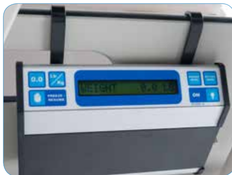
Optional factory-installed scale system

WARNING: Cancer and Reproductive Harm - www.P65Warnings.ca.gov