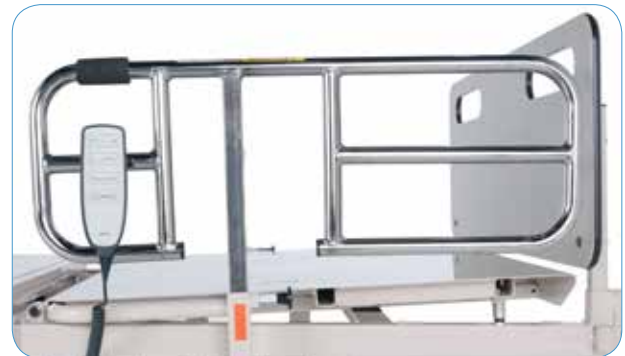
Standard Chrome Rails (pair), shown with optional 5-function Hand Control