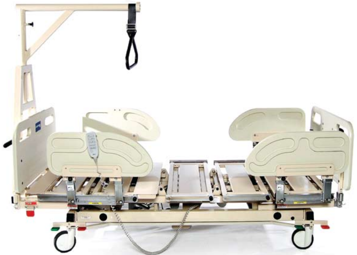
Elite Bariatric Acute Care Bed

The Elite Acute Care Bed provides your bariatric patients with all of the above in an easy-to-use design, engineered to allow you to give your patients the best possible care.